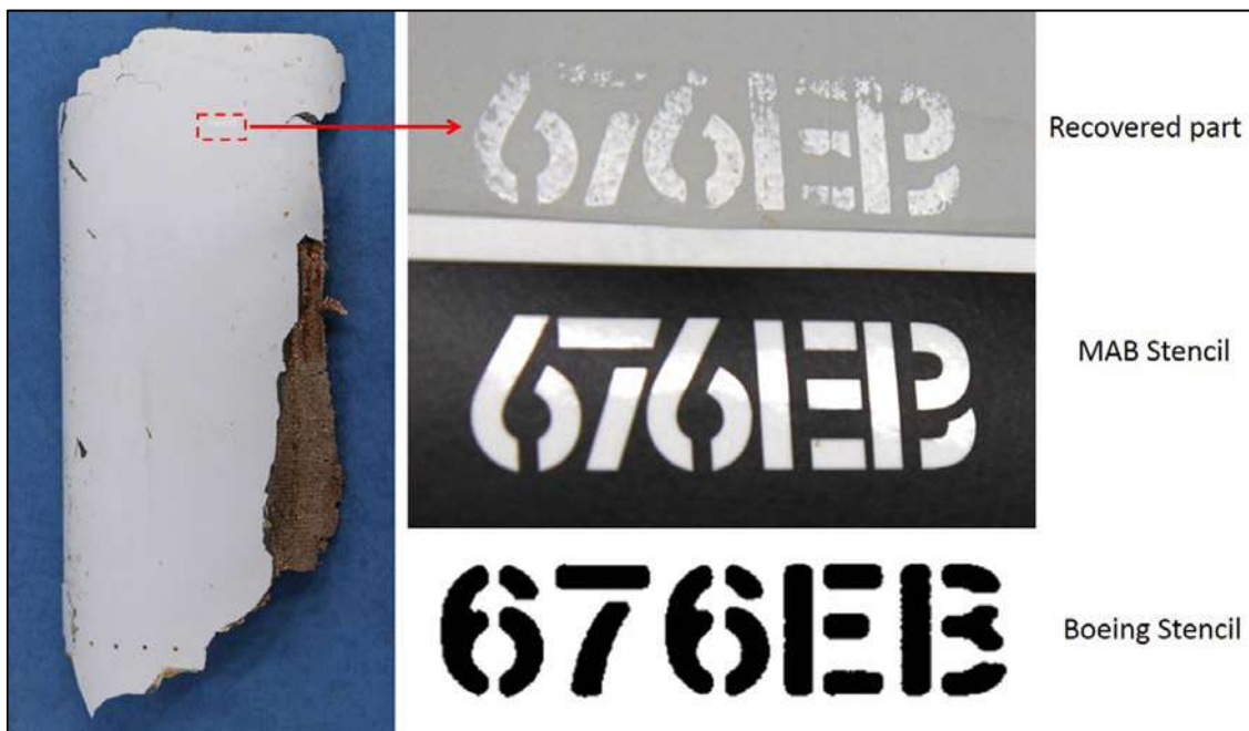
Figure 2: Flap fairing outer surface showing stencil location and comparison