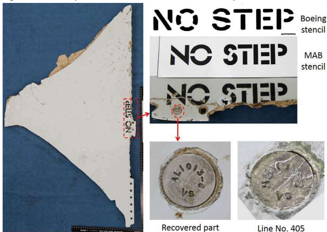
Figure 4: Stabiliser panel “NO STEP” stencil and fastener comparison